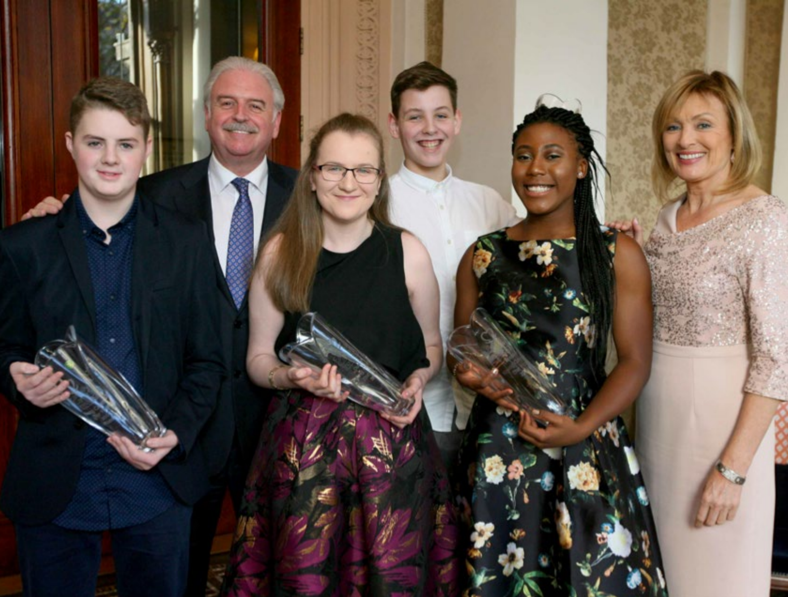
The Young Carers of the Year 2016